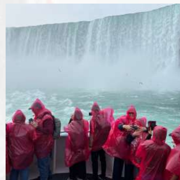
Visit to Niagara Falls