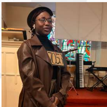
Black History Month

We have planned a number of activities and events that encourage students to learn while also encouraging their creativity and inventiveness.